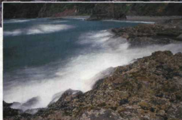
Here's the 10-second image after adjustment with Adobe Photoshop plug-in filters.

other than outdoor skylight, you will find yourself looking through dozens of charts and graphs trying to calculate the exposure time for each type of light source. The variables here are endless.