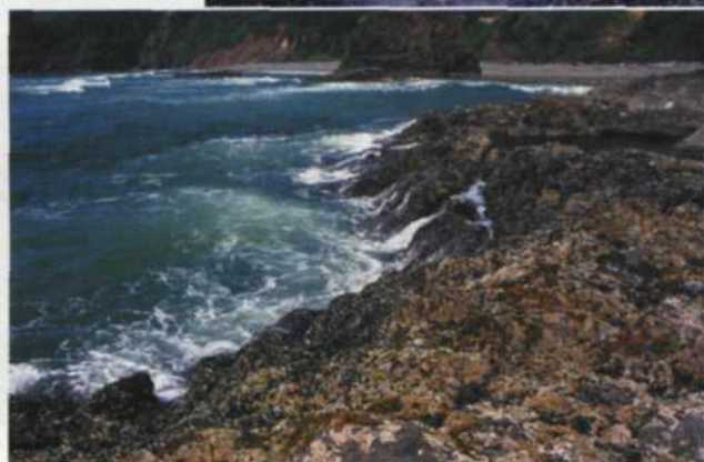
A normal sunlight exposure on ISO 100 color-negative film. Time = \frac{1}{100} second.