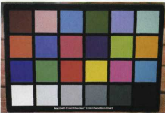
Fujicolor ISO 160 negative exposed at meter setting. Time = 1/2 second.