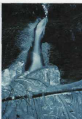
This Kodachrome image was taken in late afternoon in winter. Meter = 10 seconds Actual = 15 seconds.