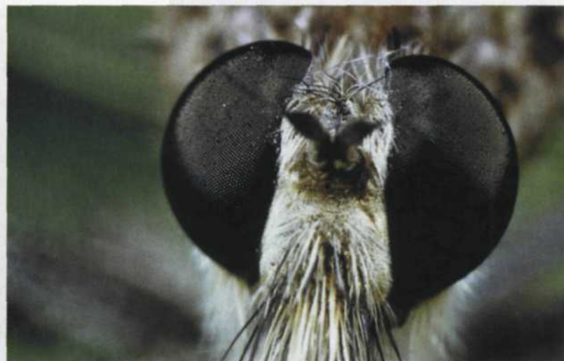
Here's the same subject with the exposure increased \frac{2}{3} stop to compensate for reciprocity failure. No color adjustment was needed.