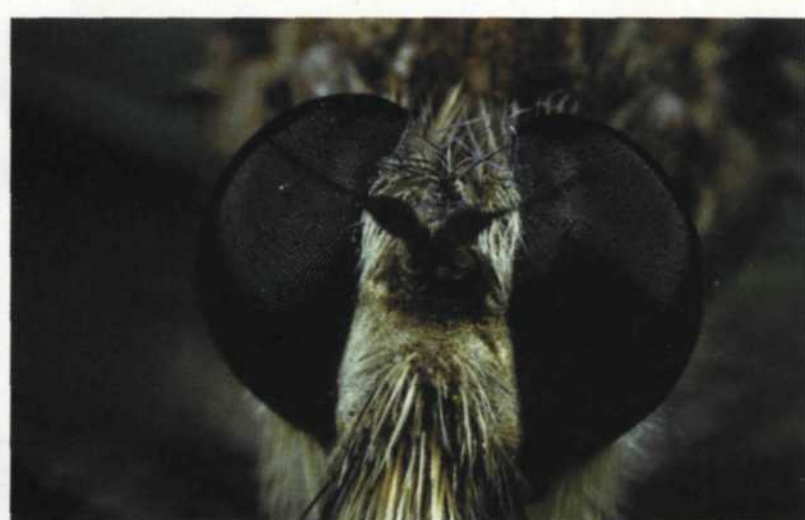
Close-up image of a fly using normal TTL flash exposure. Flash duration was very short. Reciprocity failure occurs at very short exposure times as well as at very long ones.